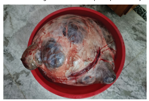
Figure 3. Photograph of the specimen after right salpingo-oophorectomy.

In the post-operative period, following decompression of the distended abdomen, she developed hypotension and was managed with noradrenaline infusion. She was tapered off the infusion on the third post-operative day. The remainder of her hospital stay was uneventful and she was discharged on the seventh post-operative day.