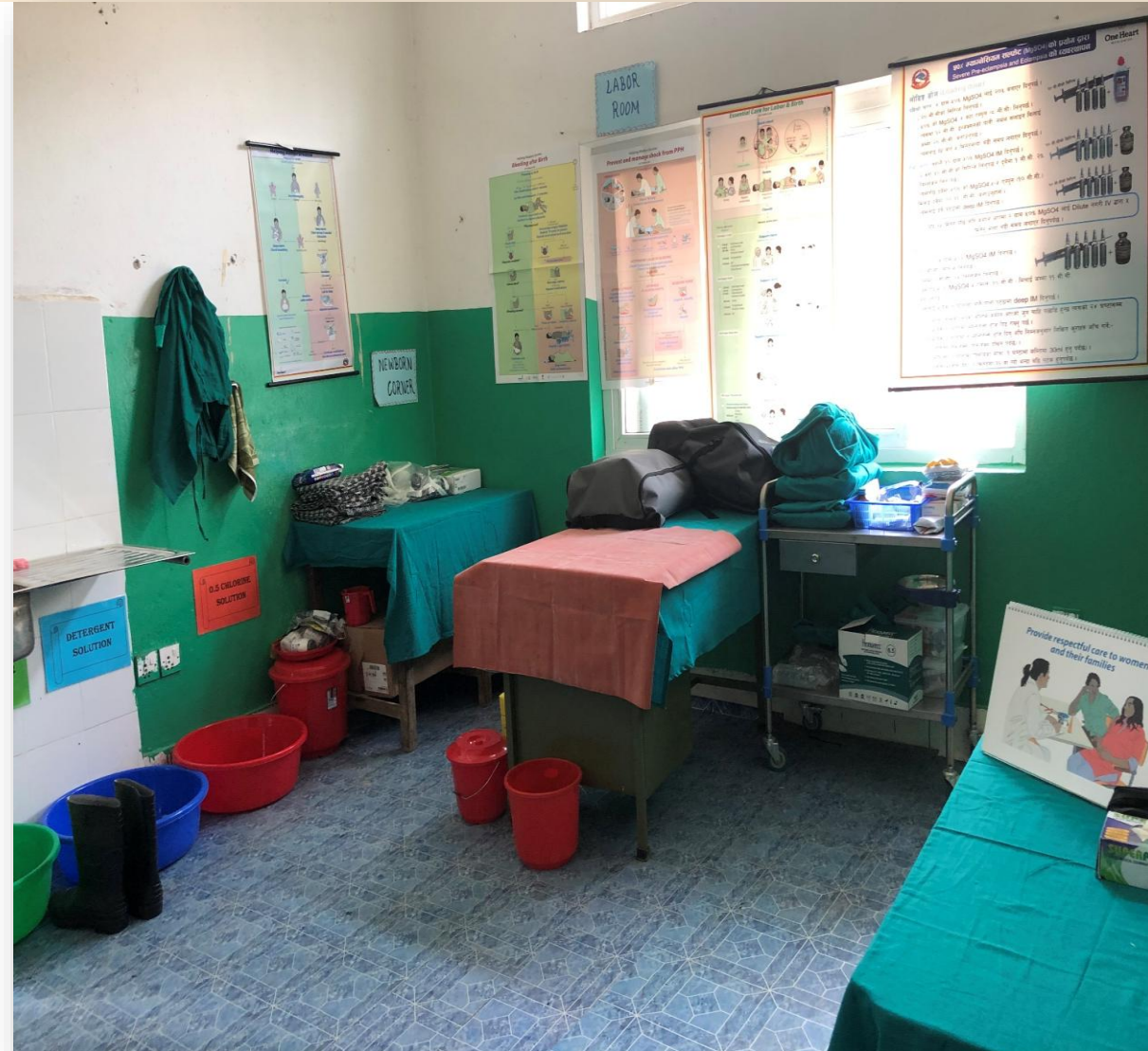
Picture: A simulation lab set-up