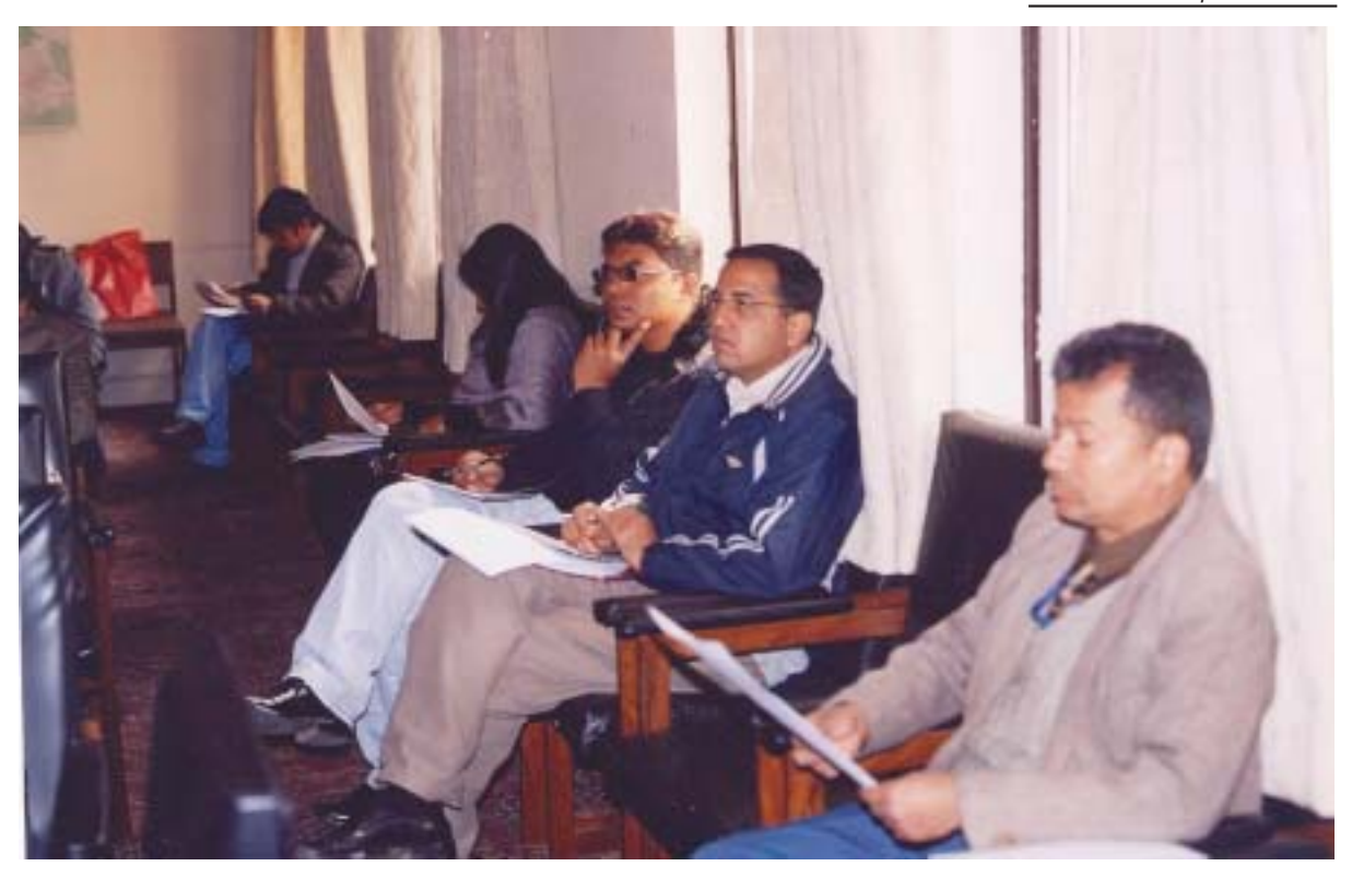
5. Training Workshop on Good Clinical Practices in Clinical Trials