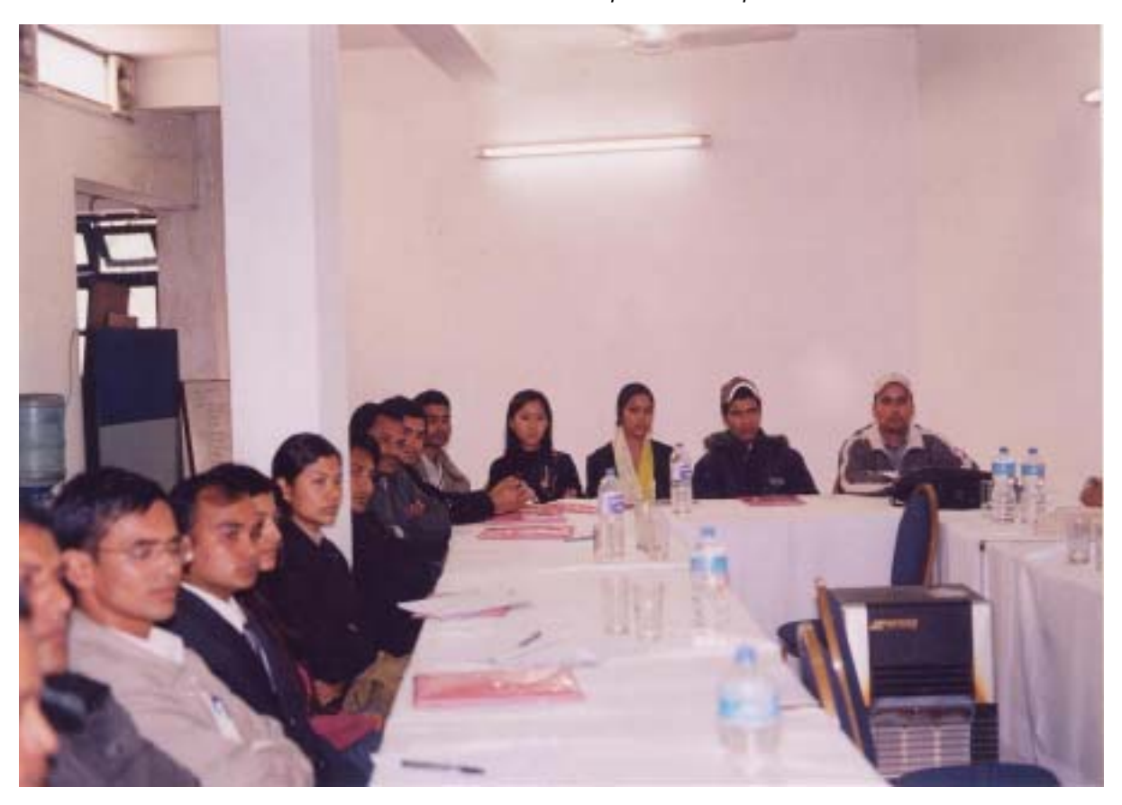
9. Regional Meeting of South Asian Forum for Health Research (SAFHR)