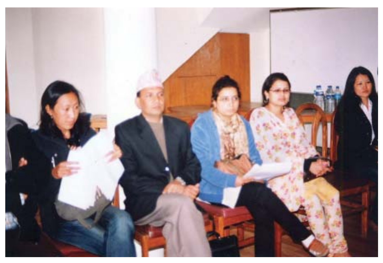
4. Dissemination of the Research Findings Price of Drugs