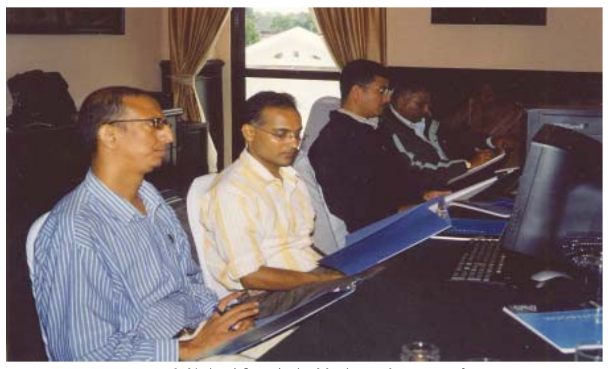
2. National Consultative Meeting on Assessment of National Burden of Disease in Nepal

1. Training Workshop on Advance Epidemiology