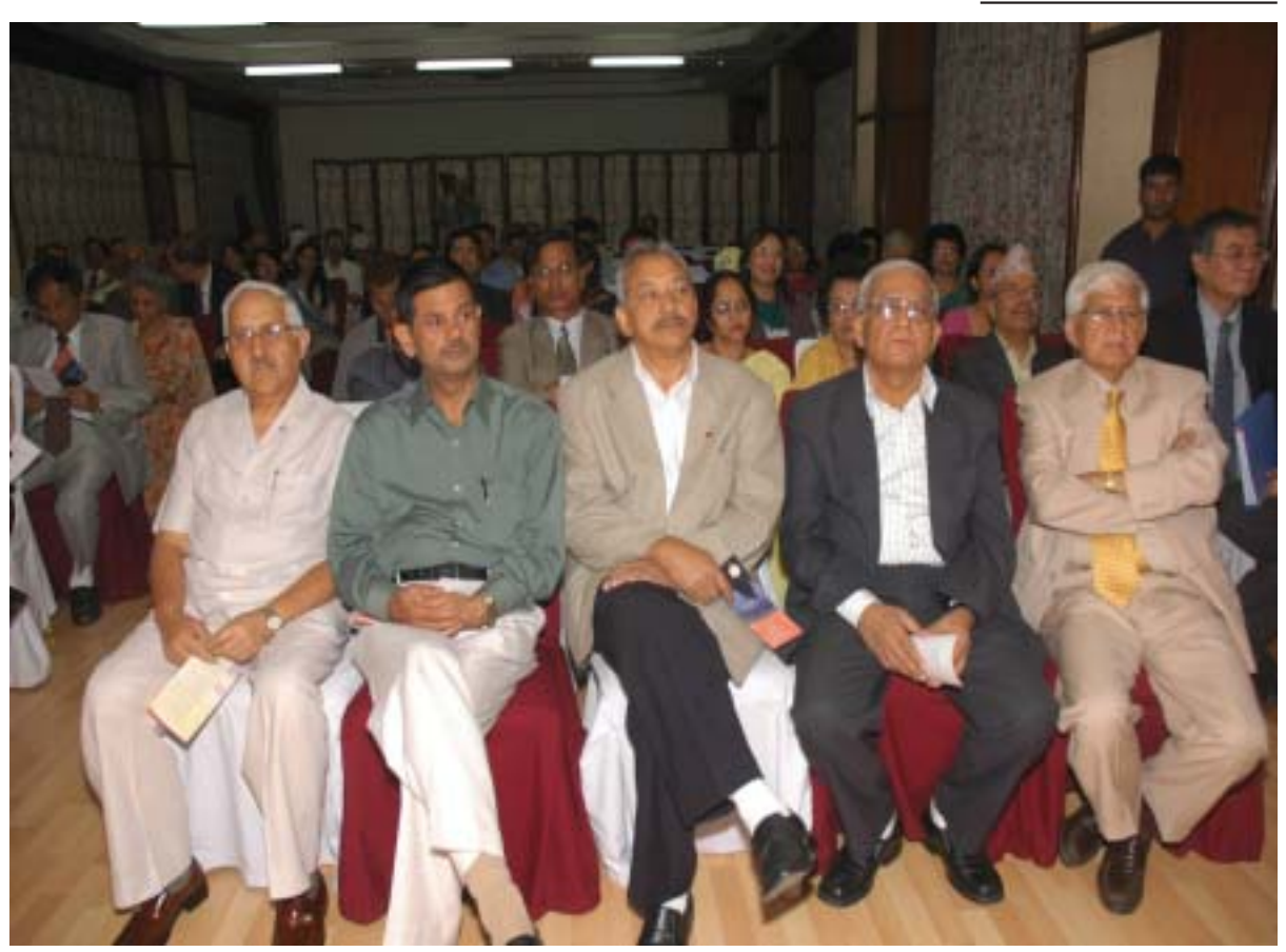
10. Training Researchers on Writing in Bio-medical Journals