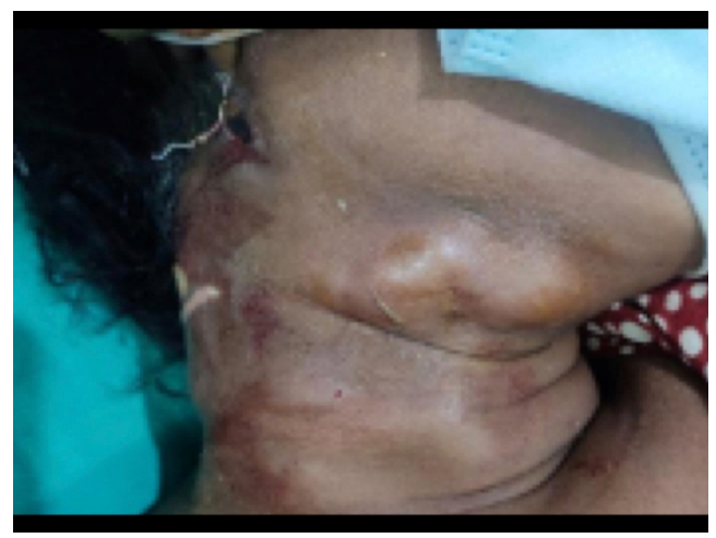
Figure 1. A photograph showing swelling with multiple loculations in right side of neck with overlying erythematous skin.

submandibular region, right lateral and posterolateral part of the neck and in the pre-auricular region (Fig. 1). The overlying skin was erythematous with area of selfburst and pus exudation from right upper lateral neck.